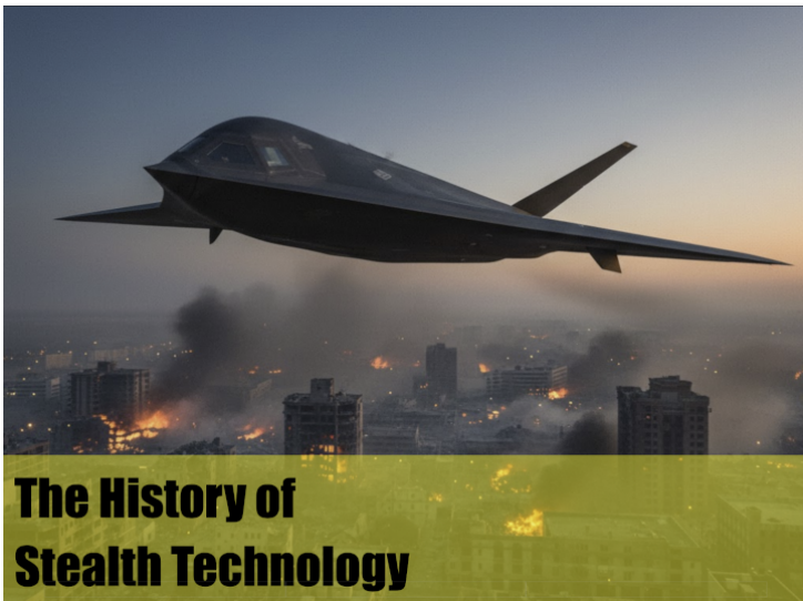
The History of Stealth Technology

Learn about the technologies used to create these state-of-art war machines. We also explore the future of Stealth Technology in modern warfare.