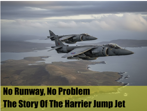
No Runway, No Problem The Story Of The Harrier Jump Jet

It wasn't just a new plane; it was a new way of fighting.