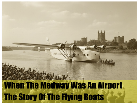
When The Medway Was An Airport The Story Of The Flying Boats

From the heart of Rochester, giant silver "Flying Boats" would roar down the river, lifting off to connect the British Empire—from Southampton to Sydney and everywhere in between.