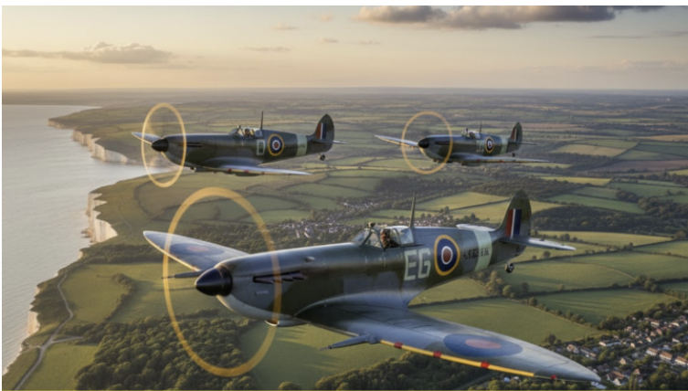
The Battle of Britain Victory Against The Odds

Without these secret tactics the outcome could have been very different.