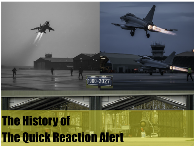
The History of The Quick Reaction Alert