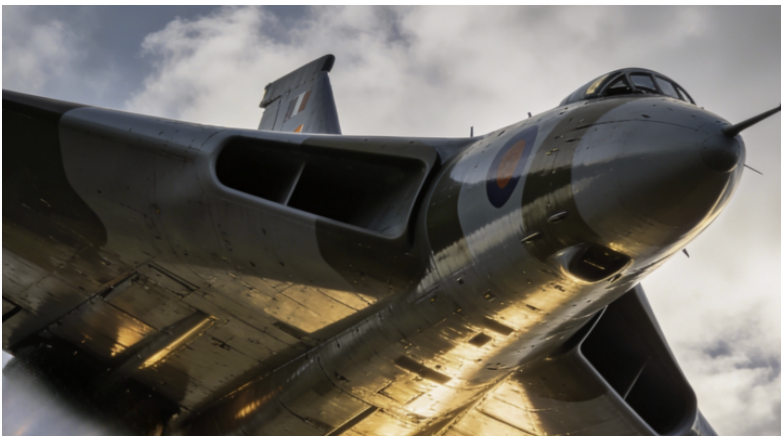
Avro Vulcan Delta Deterrent

Or how the Vulcan was used to help develop Concorde?