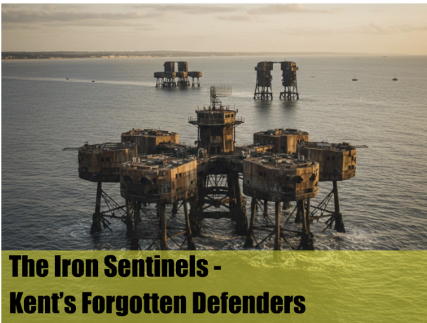
The Iron Sentinels - Kent's Forgotten Defenders