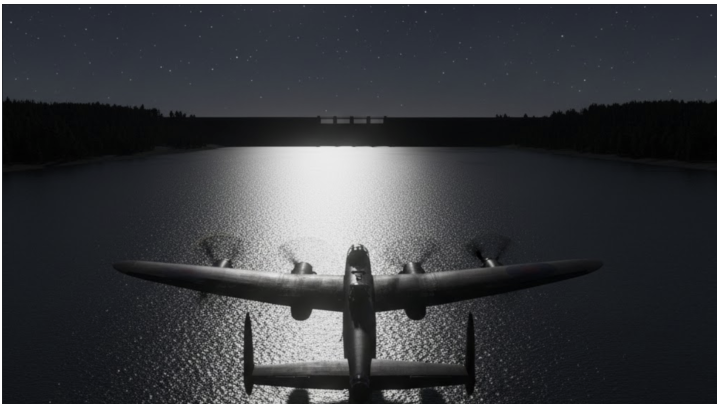
The Dambusters The Impossible Mission

Do you know the links this mission has with Herne Bay, or where you can still see the bouncing bombs?