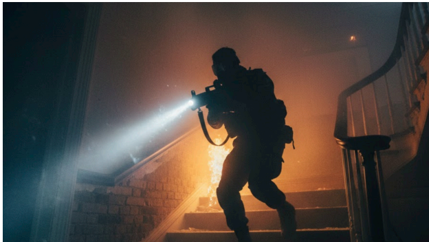
Operation Nimrod - The SAS in Action

Please note : For a small additional fee I can bring life-size replica examples of SAS weapons and equipment. Just ask when you book.